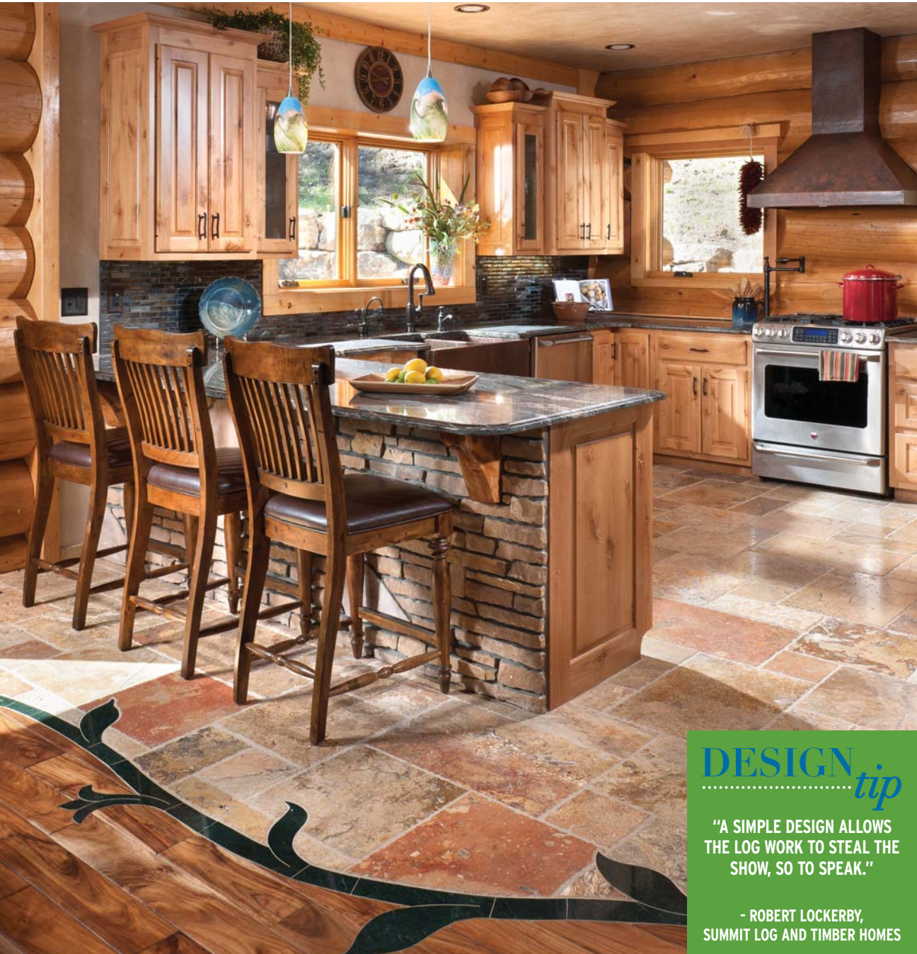
LEFT: A CUSTOM LEAF PATTERN BEAUTIFULLY ACCENTUATES THE JUNCTION OF TILE AND TEAKWOOD FLOORING IN AN ELEGANT FORM THAT COMPLEMENTS THE RUSTIC CHARM OF THE MEADOW. RIGHT: WIDE WINDOWS AND THE GLASS PANES OF FRENCH DOORS ALLOW NATURAL LIGHT TO ILLUMINATE THE DINING AREA OF THE MEADOW. THE JACK DANIELS DISTILLERY BARREL, CARRIED WEST FROM LYNCHBURG, TENNESSEE, ADDS AN ELEMENT OF WHIMSY. BELOW: FLAMES LEAP FROM THE DEEP STONE FIRE PIT, AND A PAIR OF ADIRONDACK CHAIRS COMPLEMENT THE DISPLAY OF EXTERIOR STONE ARTISTRY THAT IS APPARENT AT THE MEADOW.