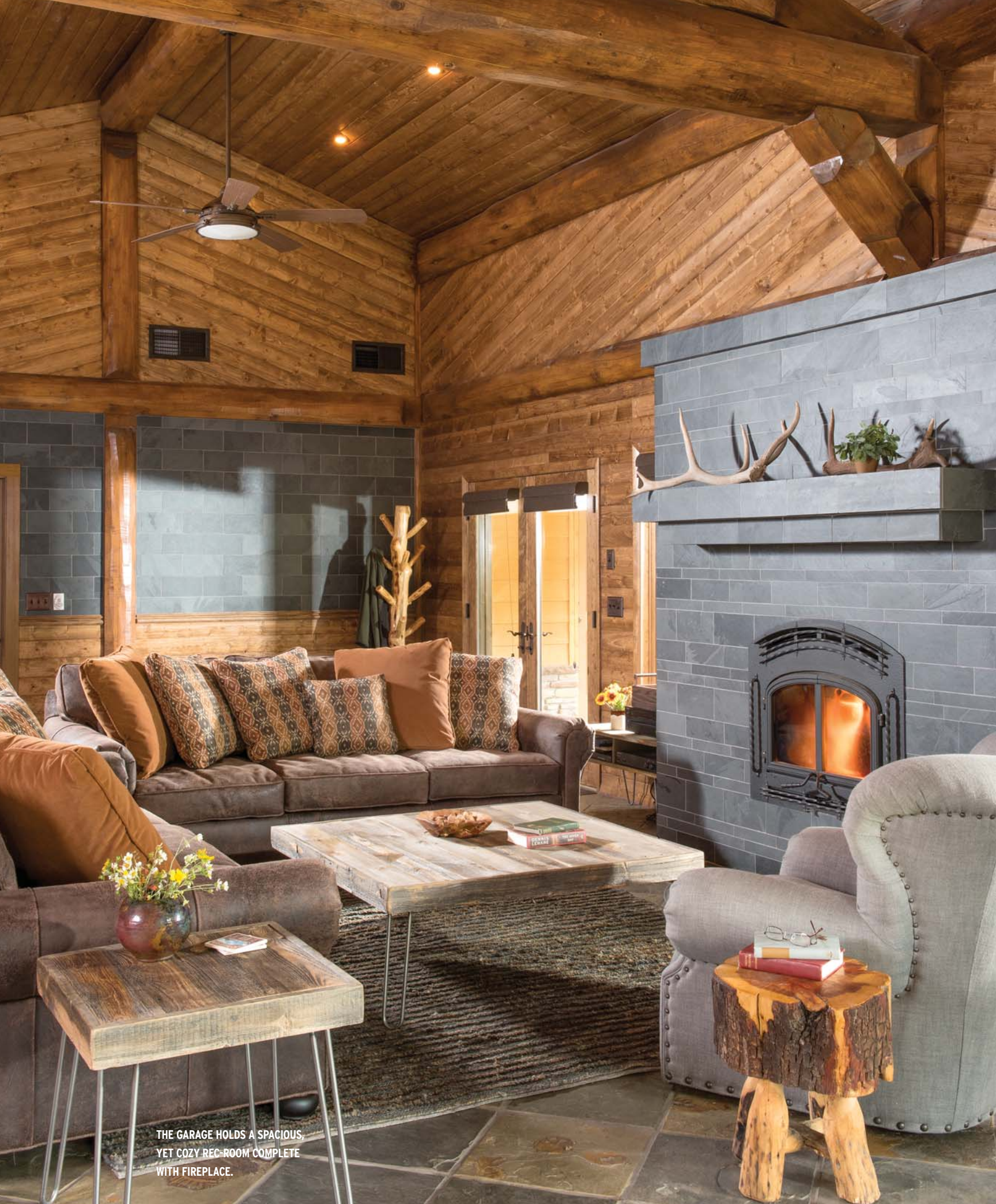
THE GARAGE HOLDS A SPACIOUS, YET COZY REC-ROOM COMPLETE WITH FIREPLACE.