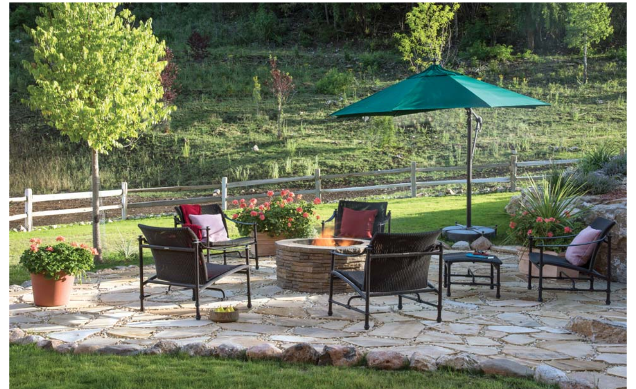
RIGHT TOP: THE STONES USED FOR THE PATIO SEATING AREA ECHO THE CLOUDCROFT AREA'S NATURAL ROCK OUTCROPPINGS.