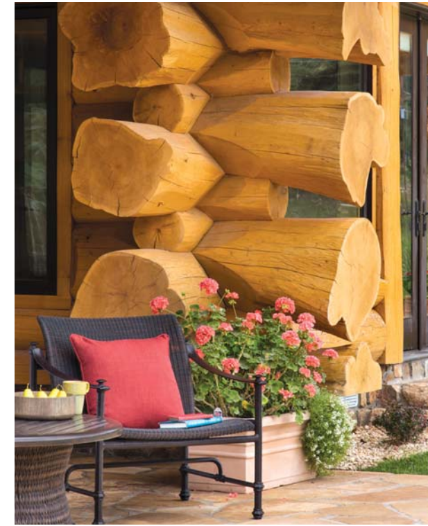
BELOW: DRAMATIC CORNER FLARES SHOWCASE THE NATURAL BEAUTY OF WESTERN RED CEDAR AND MAKE A VISUAL IMPACT. RIGHT: A SHELTERED PATIO OFFERS PRIME SEATING FOR ENJOYING THE VIEW OF THE MEADOW BELOW.