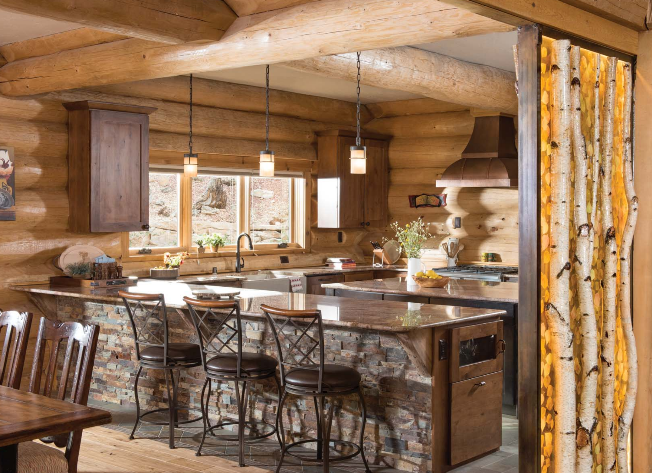
A SPACIOUS OPEN KITCHEN IS A WELCOME FEATURE WHEN ENTERTAINING FAMILY AND FRIENDS.